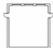
GROUND FLOOR PLAN GROUND FLOOR PLAN